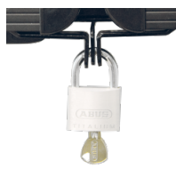
Brackets and wing lock for locking the side wings in front of the display