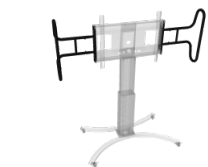
Two large and sturdy handles