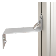
Lockable wall brackets