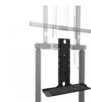
Keyboard tray for DCS system