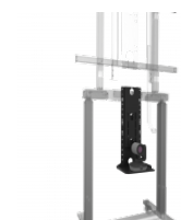
Camera shelf for DCS system