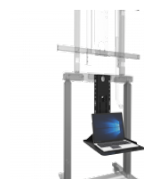
Laptop shelf for DCS system