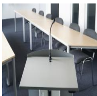
Accessories lectern - "Cutout for gooseneck microphone".

Lectern accessories - installation of a power on/off switch for media technology