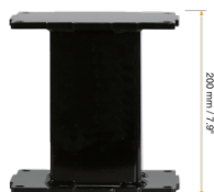
Extender for height adjustable aluminum columns in different versions