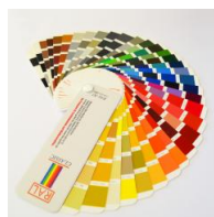
Surcharge for special paint finish for presentation furniture

Surcharge for collision protection motor