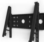
LCD mount - Surface Hub 2S 85"