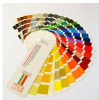
Lectern-S - Accessories - Special paintwork front panel Lectern-S