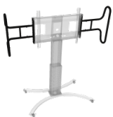
Two large and sturdy handles