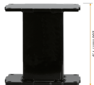
Extender for height adjustable aluminum columns in different versions