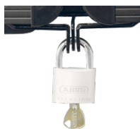
Brackets and wing lock for locking the side wings in front of the display