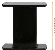
Extender for height adjustable aluminum columns in different versions