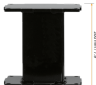
Extender for height adjustable aluminum columns in different versions