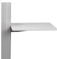
Side shelf for laptop