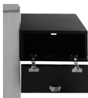
Lockable notebook cabinet